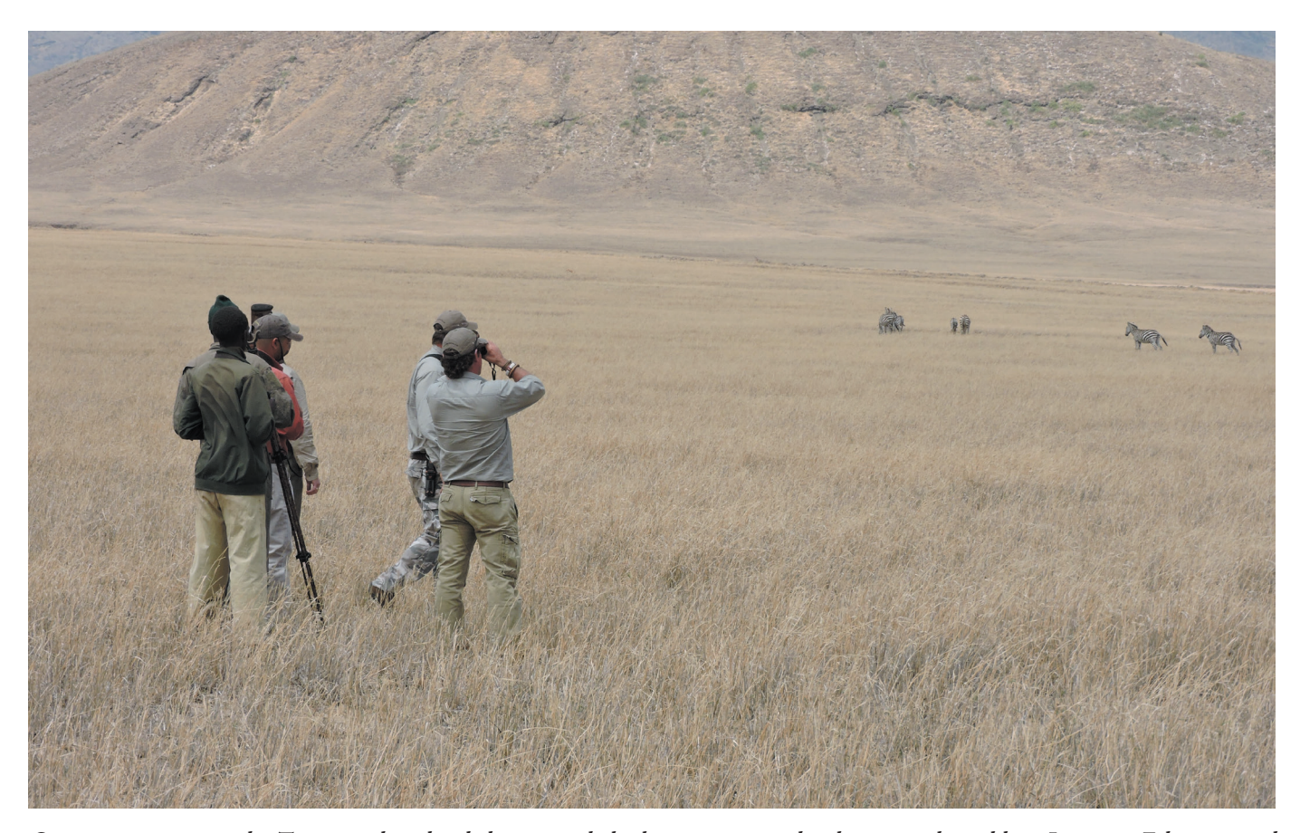
One must question why Tanzania has decided to extend the hunting season by three months, adding January, February and March. Is it needed? Is it for biological reasons? Or economic ones? Or is it to fix a system that already was not working?

Have you heard of any studies of the criteria for determining open and closed hunting seasons, when to hunt or not hunt? I know that in Europe, red stag are hunted during the rut, and the same for elk in the States."